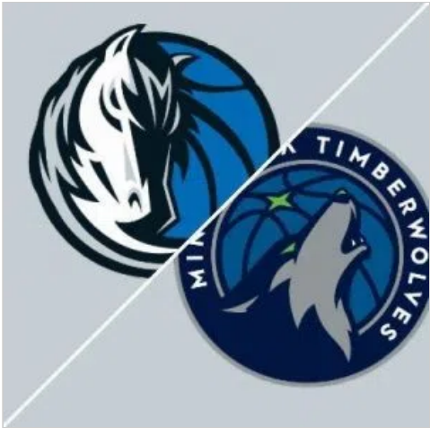
Dallas Mavericks Open As Underdogs to Timberwolves in Western Conference Finals